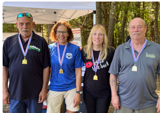
The 2022 gold medal winners from the New Hampshire Senior Games disc golf challenge held at the Hollows North Disc Golf course in Manchester on July 9, 2022.

To inquire about volunteer opportunities, member activities or the availability of membership on the Board of Directors, please call 603-488-0229 or email info@nhseniorgames.org